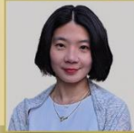
Zhou Fang International Group